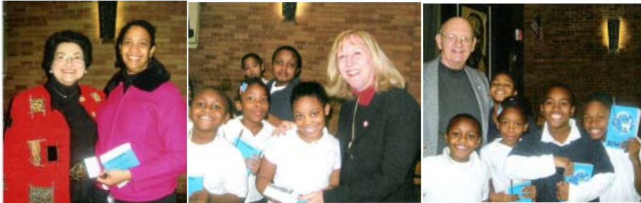
The KC Rotary Club Foundation needs your support!