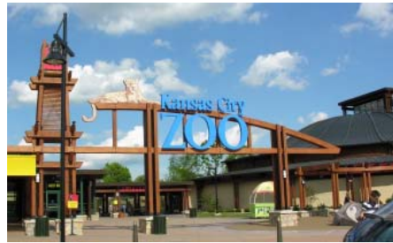
The new zoo entrance.