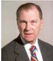
by Pete Burgess

The 2008 Club 13 Holiday party signaled the beginning of the holiday party season Rotary style at the always classy setting of the Hyatt Regency Hotel at Crown Center.