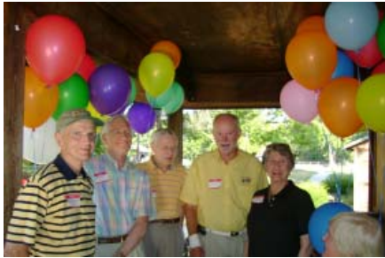
What a colorful gathering!