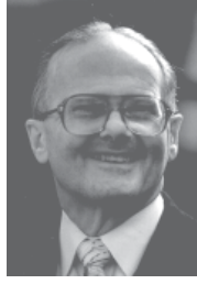
Lamar Hunt December 13, 2006