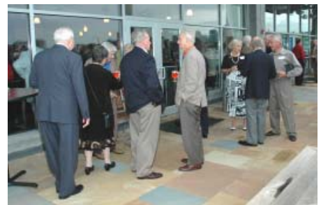
Members enjoy the perfect weather on the balcony.