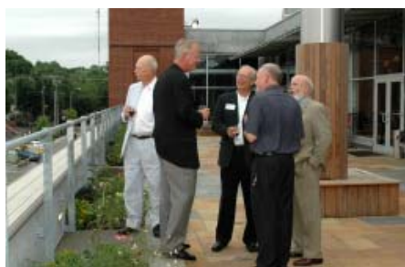
The balcony had a wonderful view of the city, especially at dusk.