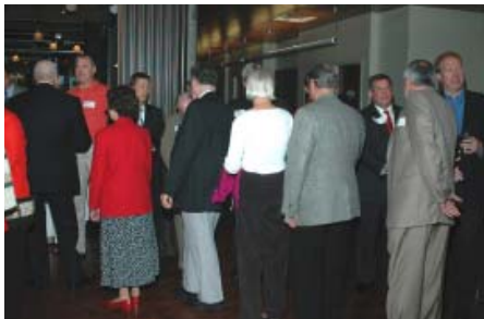
New board members greet the crowd.