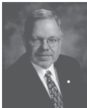
by Jim Holmberg

Imagine the thrill of riding a surfboard, conquering one of the most powerful waves in the world off the North Shore of Oahu. Picture racing across the face of the infamous Bonzai Pipeline, riding in the sweet spot but just a few inches or a subtle weight shift from a possible wipeout.