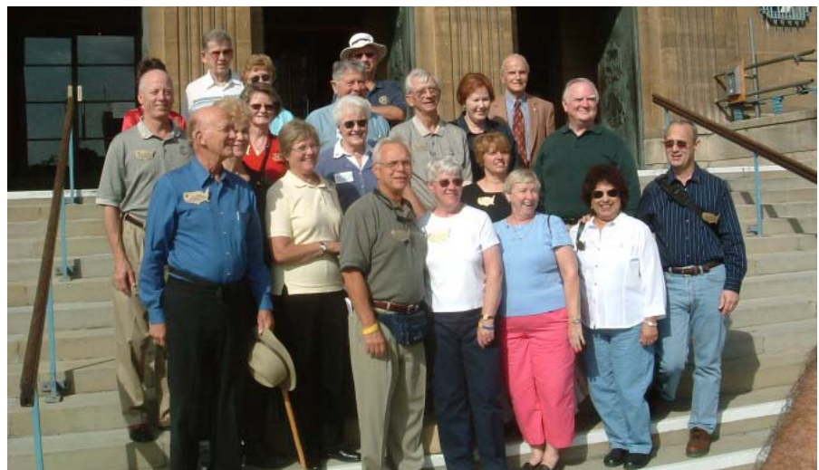
Friendship Exchange delegation to District 1080 in East Anglia, U.K.