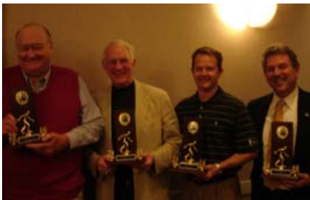
First Place team, Tuesday Terrors, with trophies.

We'll be counting down the days until next season. Have a great summer.