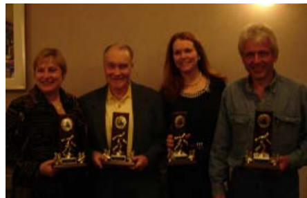
Second Place team, Spirit, with trophies.