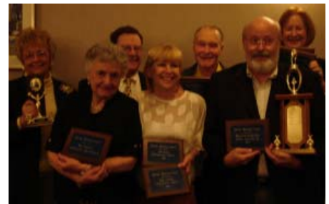
Group photo of individual award winners with their trophies.