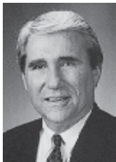
by Harlan Burkhead

ARROWHEAD STADIUM CLUB — Red Friday Eve, 2005: As we waited in line for our stadium fare (burgers and hot dogs with assorted potato offerings), we scouted the Chiefs going through their paces at quarter speed on the stadium floor below. Trent Green's leg looked good – at least at quarter speed.