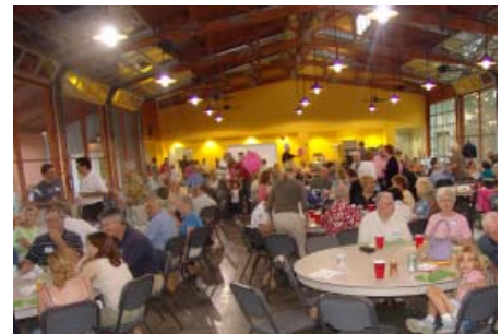
Cassell Hall in action.