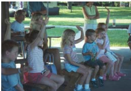
Children enjoying the Zoo Mobile at Family Picnic.