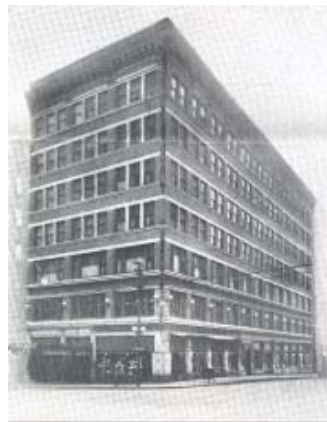
Dixon Hotel, 12th & Baltimore