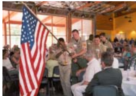
The Boy Scouts from the Delano Troop presented the flag.