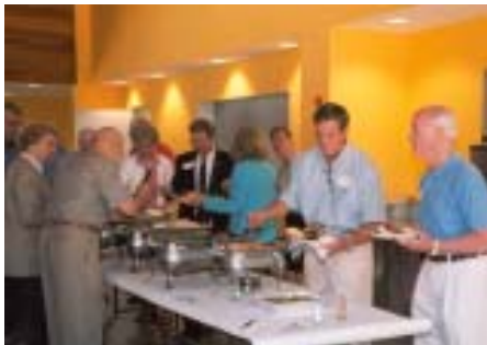
A delicious barbeque buffet, catered by Smoke Stack, was served.