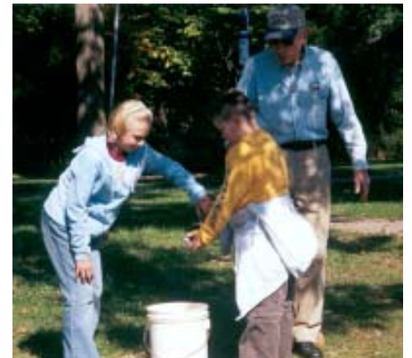
Students participating in a soil conservation experiment.