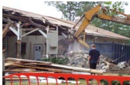
A construction worker pauses to watch the demolition of our WWI era dining hall.