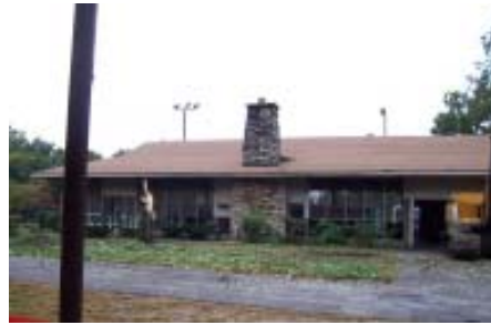
The last picture of the dining hall before the demolition began.