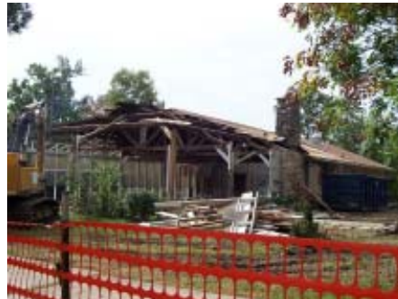
Above picture shows the roof and half the building gone.