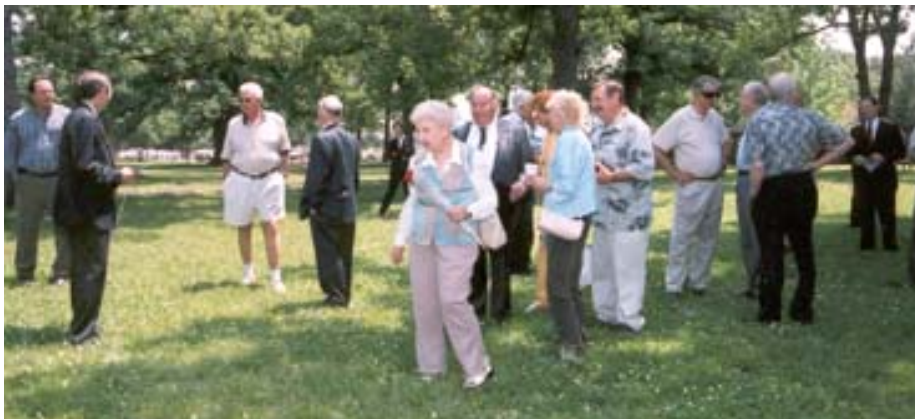
Family members of the departed join together for the tree dedication.